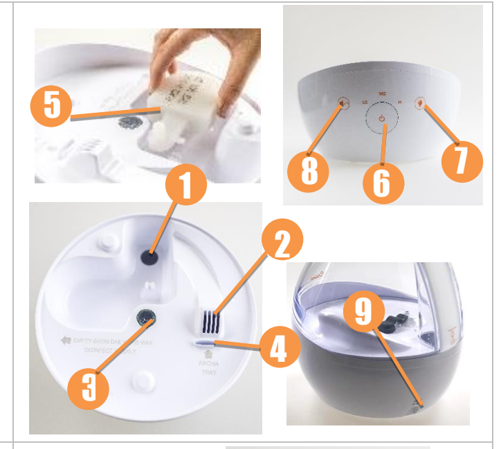
Fig. 2 (Water Tank)