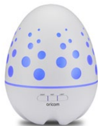
Oricom AD100 Aroma Diffuser Night Light

This Aroma Diffuser uses Ultrasonic waves to continually vaporize water and essential oil in the water tank, to produce a cool, fragrant mist.