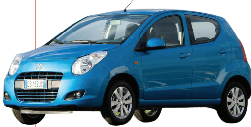
Suzuki Swift Sport From $23,990